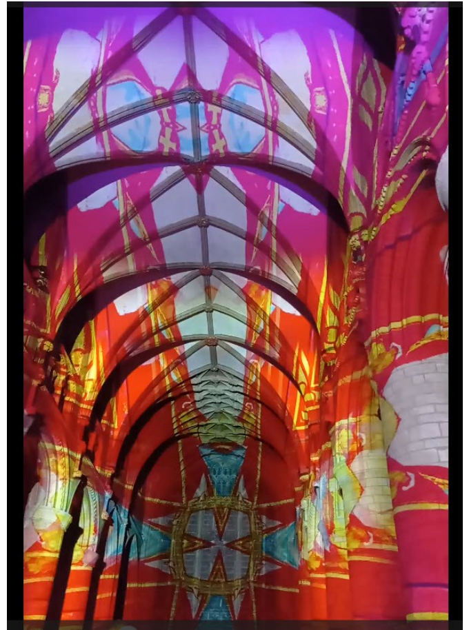
Photos taken at Gloucester Cathedral